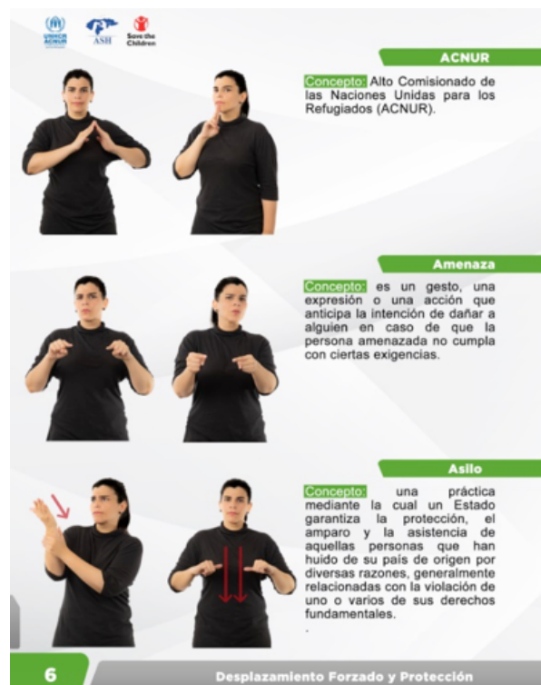
Example of the Honduran Sign Language (LESHO) Glossary.