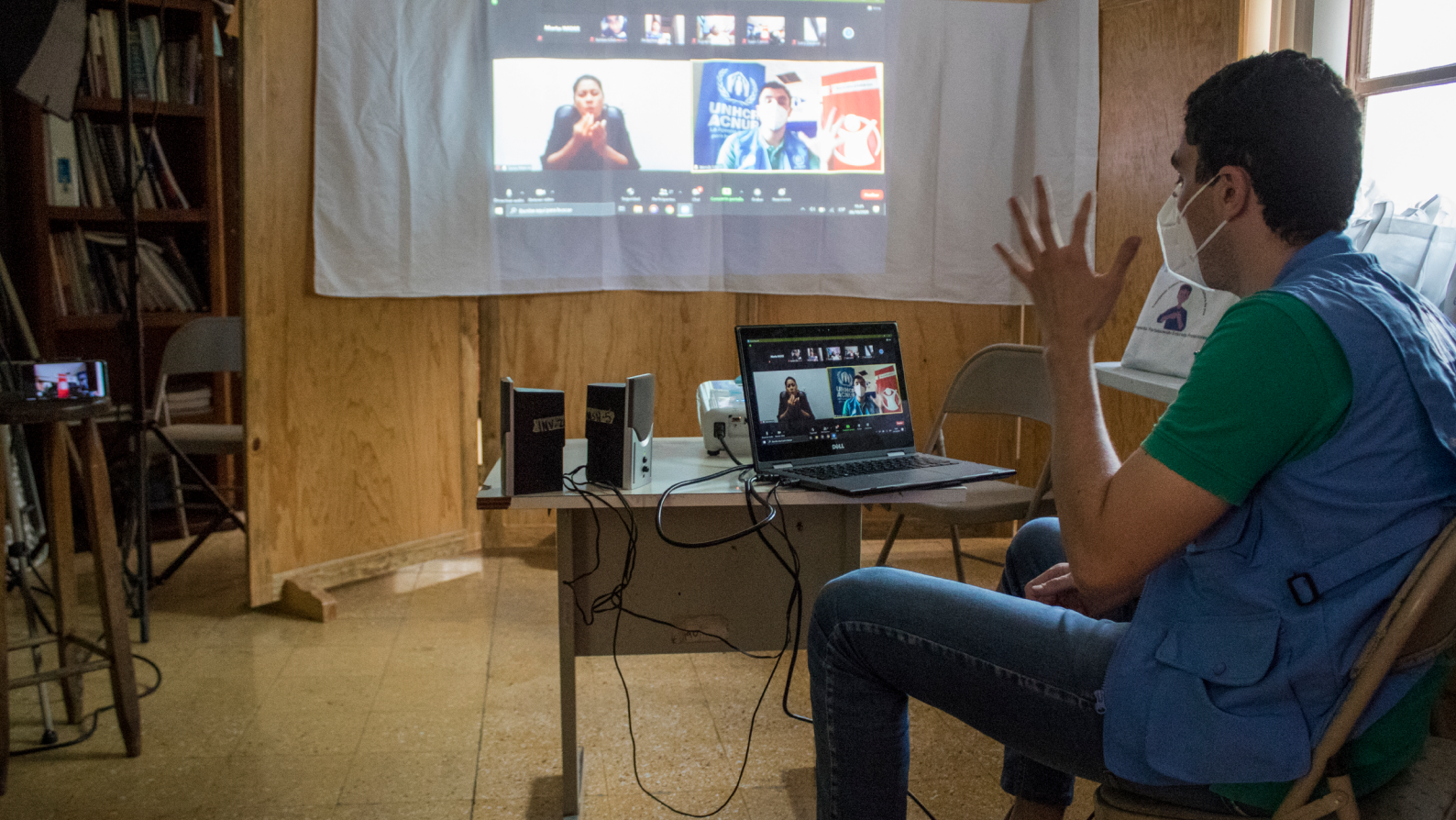
Persons with disabilities participate in online forced displacement training during the lockdown.