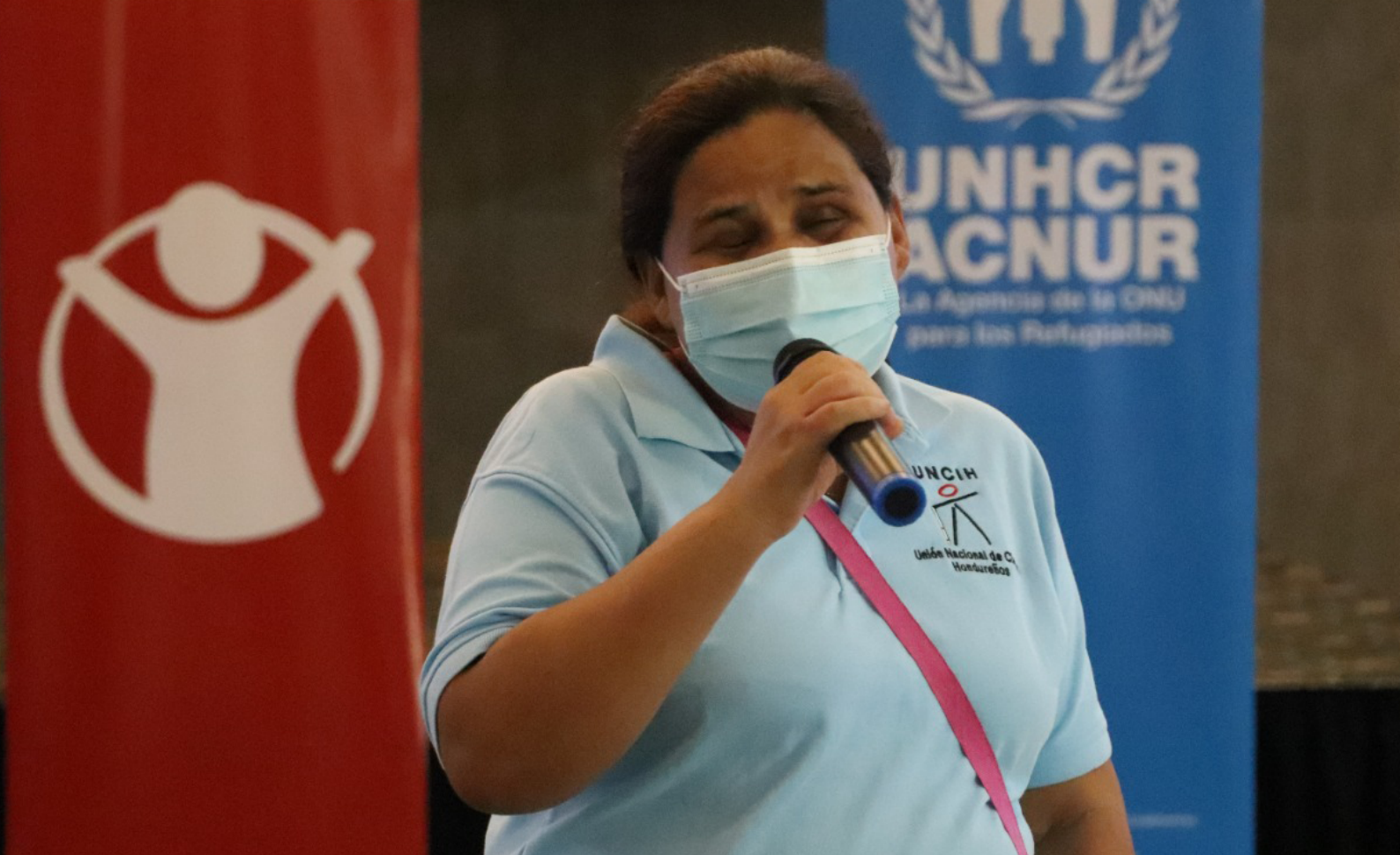
Presentation on the needs of people with disabilities by a representative of the National Union of the Blind of Honduras (UNCIH) to contribute to the construction of the National Emergency Response Route.