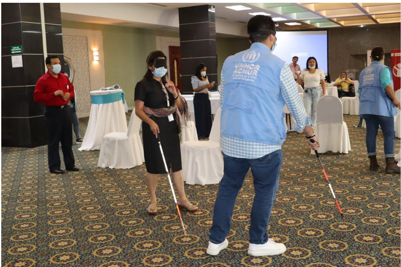
Public officials participate in a workshop on capacity building to assist people with disabilities in the application of the National Emergency Response Route.

UNHCR's work with persons with disabilities is an integral part of the humanitarian response in Honduras. In the context of its work on community empowerment and self-reliance, participatory assessments revealed that persons with hearing and visual impairments were experiencing issues understanding UNHCR's communications in relation to forced displacement. Hence, UNHCR decided to partner with Save the Children and the organizations of persons with disabilities ASH and UNCIH to ensure that key concepts related to forced displacement were adequately and appropriately explained to and understood by persons with disabilities. This work also provided the opportunity to support persons with disabilities in better understanding their rights during the cycle of forced displacement, and the specific risks they were facing in relation to the interaction of their impairments with different contextual risk factors, such as the increased risks of forced recruitment by criminal groups, gender-based violence and human trafficking.