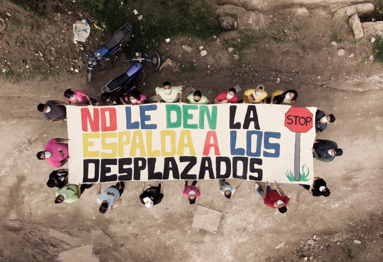
Honduras. Social worker wins UNHCR Nansen Refugee Award regional prize for the Americas