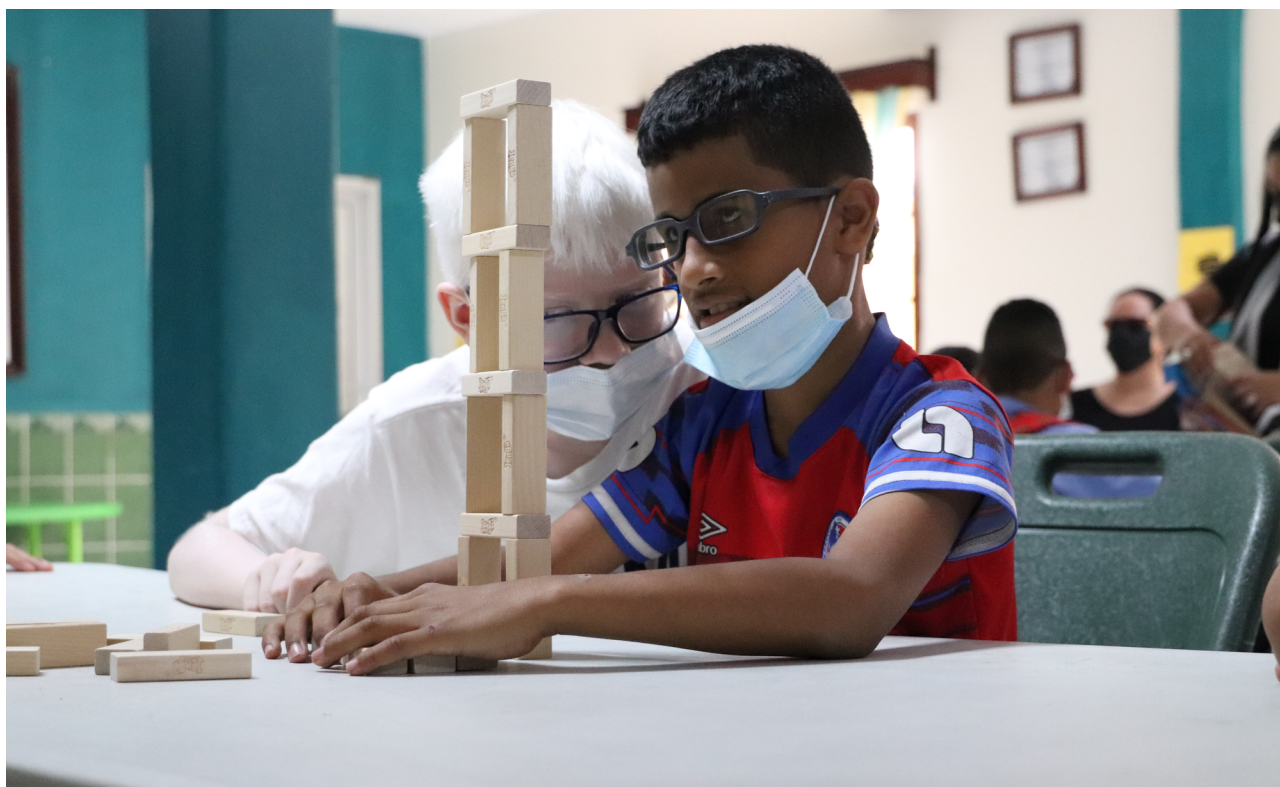
Blind students of "Pilar Salinas" school participate in activities to promote social cohesion.