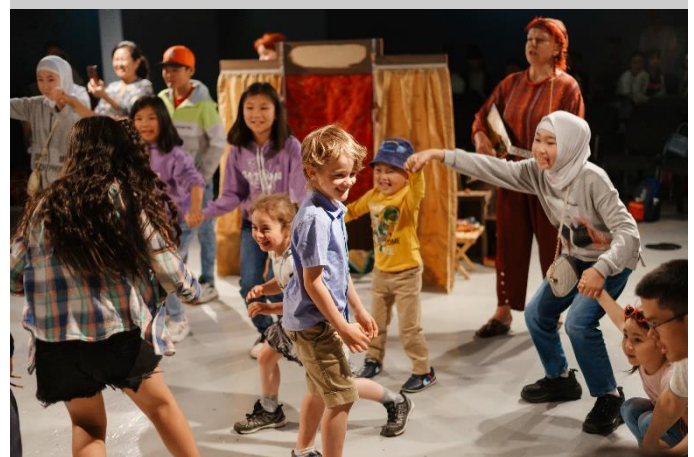
Children attending theater performance 'Beauty Aygul' based on an Afghan fairy tale during the World Refugee Day celebrations in Moscow. 18 June 2022