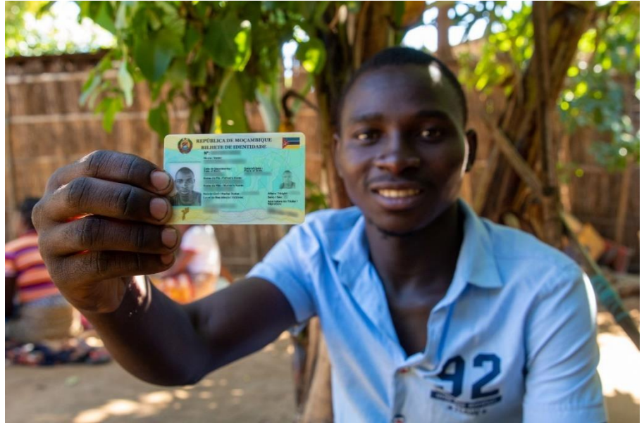
UNHCR and UCM are supporting displaced families in accessing documentation, including IDs and birth certificates

■ Access to Civil Documentation in Pemba, Cabo Delgado: UNHCR and the Catholic University of Mozambique (UCM) mobile legal clinic provided legal assistance to 261 internally displaced persons over 2 - 6 August (111 women, 80 men, 37 girls and 33 boys) from Quissanga, Muidumbe, Macomia and Mocimboa da Praia currently living in Pemba who required support to receive birth certificates. Legal documentation is key to enable freedom of movement, access basic services and formal employment, and prevent harassment and exploitation.