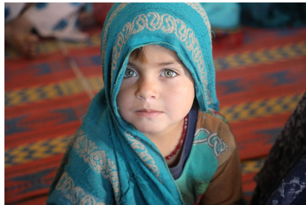
Afghanistan situation (27%)