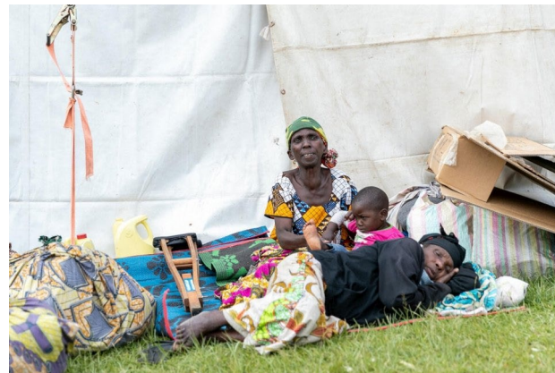
DRC situation (31%)