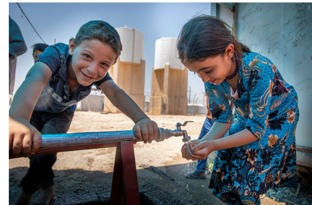
Iraq situation (19%)