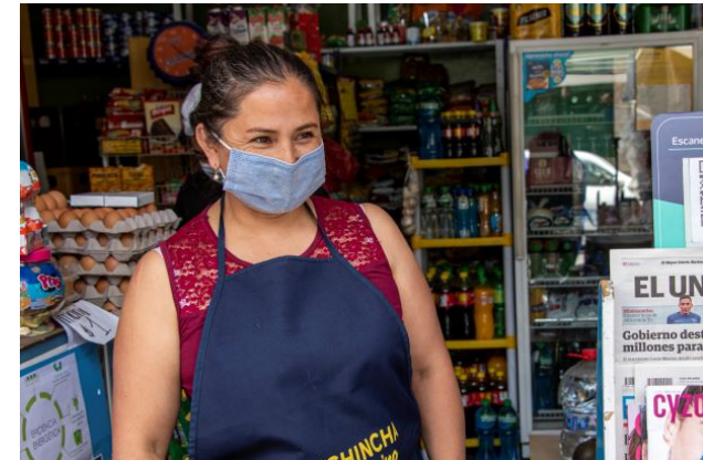
Venezuela situation (31%)