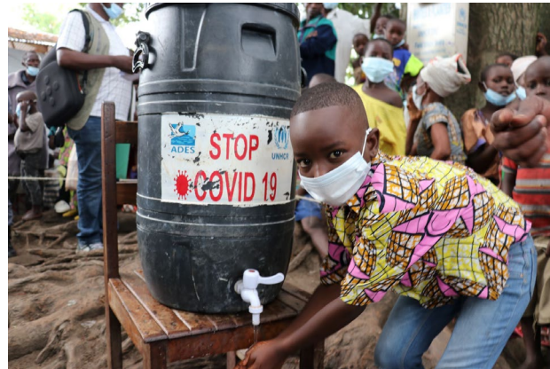
COVID19 situation (27%)