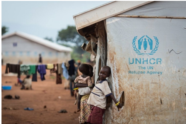
South Sudan situation (23%)