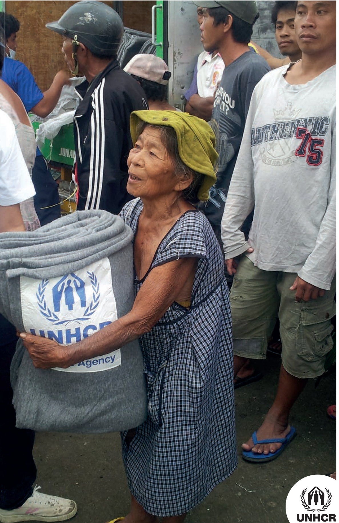
A sprightly 83 year-old lady displaced by Typhoon Haiyan collects blankets for her family in Lilioan Barangay, Philippines