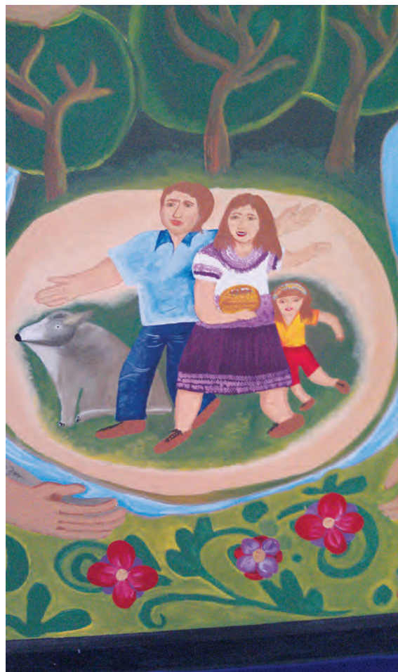
Mural brightening the wall of a shelter for individuals displaced by the conflict.

In all shelter categories, medical care is difficult for residents to access, and many said their medical needs, especially for emergency treatment and medications, often went unmet. Most of the shelters studied have a first-aid kit on-site but do not provide any other medical services in-house. Both