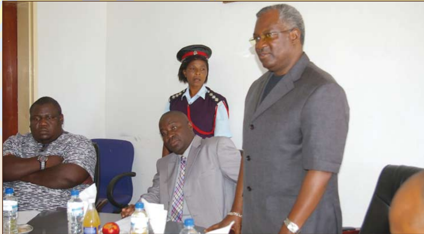
The Rwandan Minister (in Safari Suit) meeting with the then Provincial officials in Solwezi

The Rwandan Minister for Disaster Management and Refugees Affairs, General Marcel Gatsinzi, visited Zambia from 19 to 22 April 2011. During his visit, the Minister met with Government officials and Rwandan refugees in Lusaka and North Western Province.