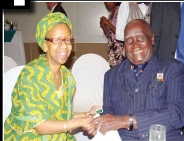
UNHCR Representative shakes hands with Dr. Kaunda