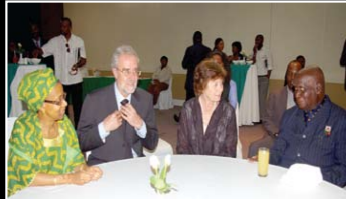
From left to right: UNHCR Representative, Danish Ambassador, UNHCR Assistant High Commissioner and Dr. Kaunda at the launch of the documentary