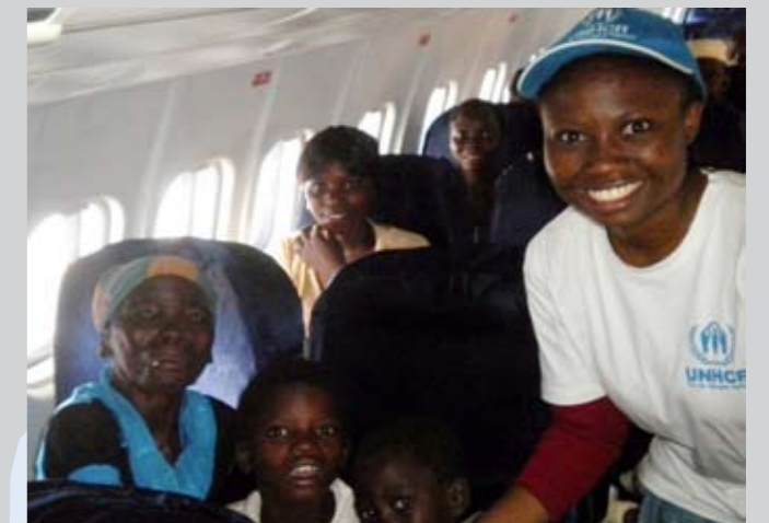
Angolan refugees disembark from a bus and board a plane at Solwezi Airport