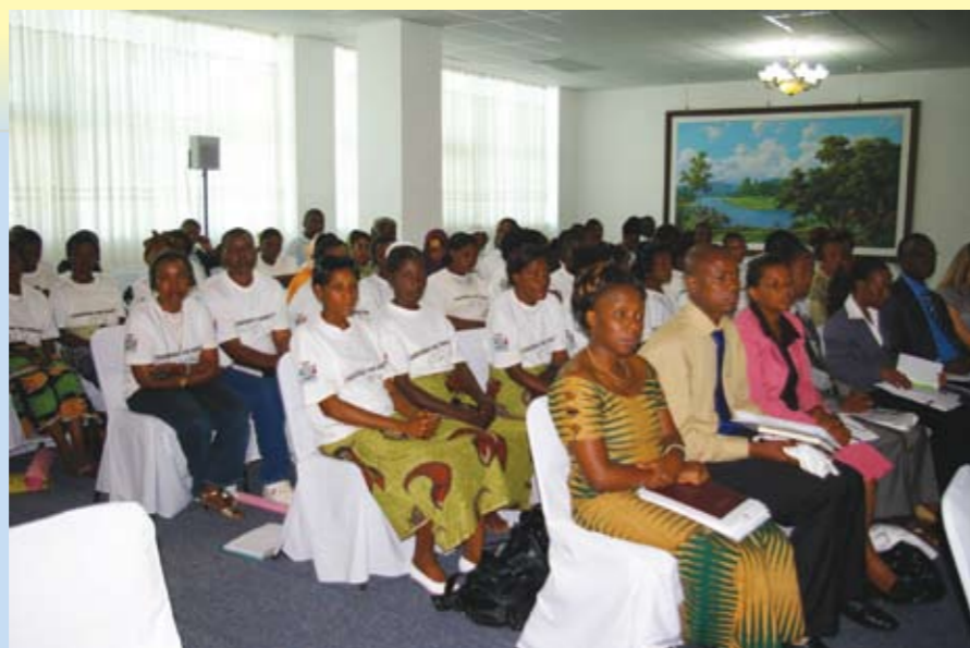
Officials and refugees at a dialogue session in Lusaka