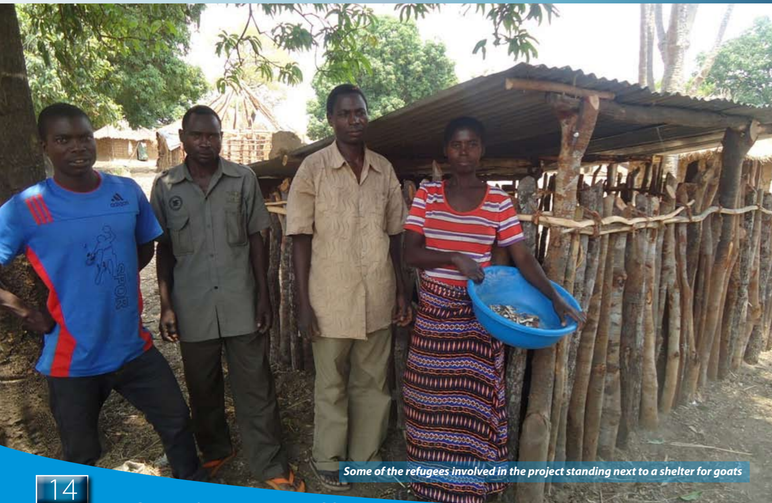
Some of the refugees involved in the project standing next to a shelter for goats

"We are very happy for this support that UNHCR is providing to us. We were provided with 18 goats. We would like to take care of them so that they can start multiplying. Currently, two goats have each one kid. We will be using these goats for meat, milk and sometimes sale to raise money if one of us requires financial support. They are also helping us to be kept health since we are required to take care of them through feeding them. We would like to thank UNHCR for the support and further we are requesting that the help be extended to other people with the similar problem within the settlement," said one of the beneficiaries.