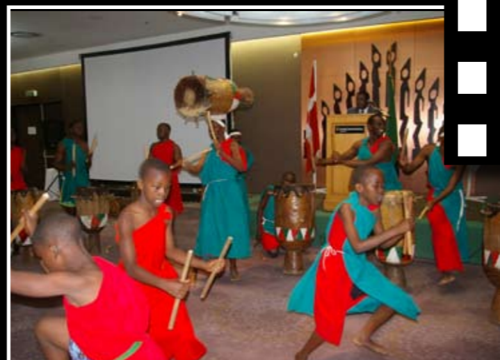
Burundi cultural group performing