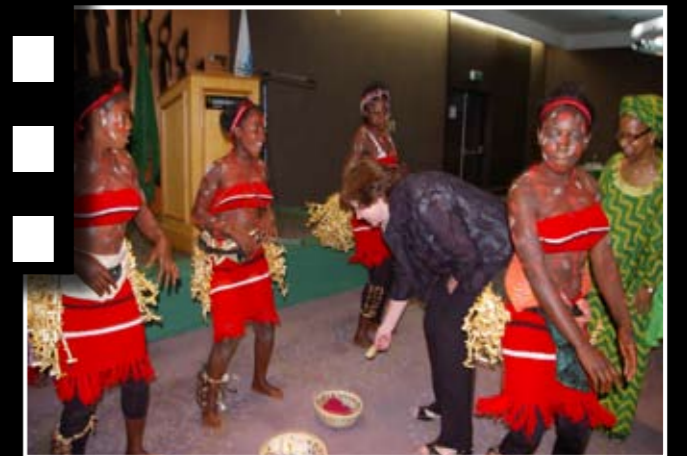
Likumbi Lya Mize dance troupe performing at the launch