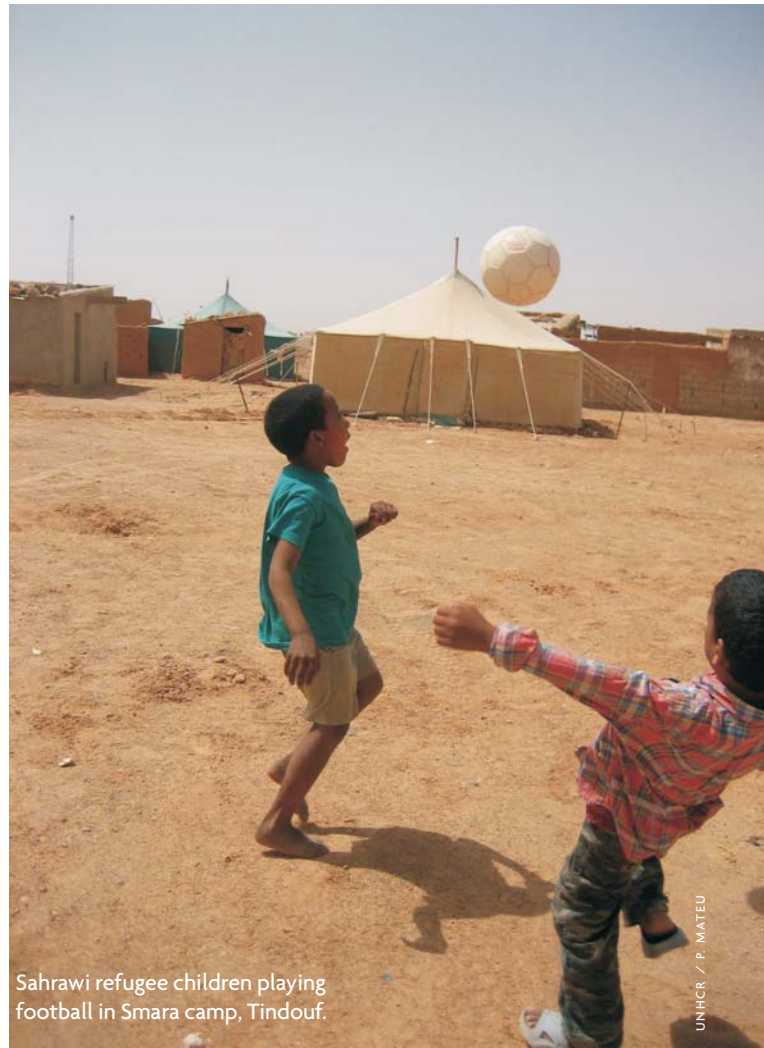
Sahrawi refugee children playing football in Smara camp, Tindouf.