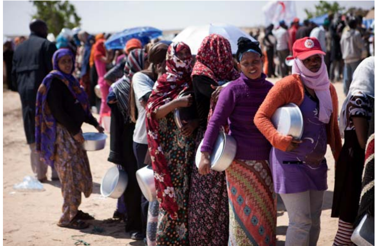
Women wait in line for food at one of three food distribution points at Choucha camp.

UNHCR's Goodwill Ambassador Angelina Jolie travelled on 5 April to the Tunisian-Libyan border to urge greater international support for people fleeing Libya.