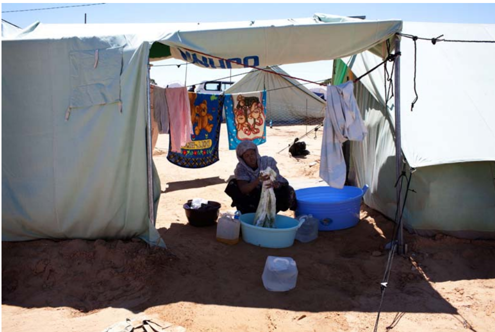
A Somali woman washes her baby's clothes in the shade of her tent at Choucha camp.

The Regional Inter-Agency Flash Appeal for the Libyan Crisis was revised on 1 April, requesting a total of USD 310.8 million for March-June. In line with revised planning and the most likely scenario, it is now estimated that up to 1,507,830 people may be affected by the conflict and require some form of humanitarian aid. Currently the appeal is 36% funded.