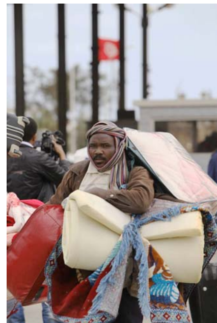
A man crosses the Tunisian border from Libya./ UNHCR/ Branthwaite March 2011