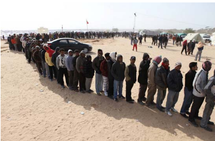
Bangladeshi men queue for food at the Choucha refugee camp.

The Regional Inter-Agency Flash Appeal for the Libyan Crisis, requesting total of USD 160.3m in funding for March-June, will be revised to update scenarios, needs and funding requirements by the beginning of April. Currently the appeal is 50% funded.