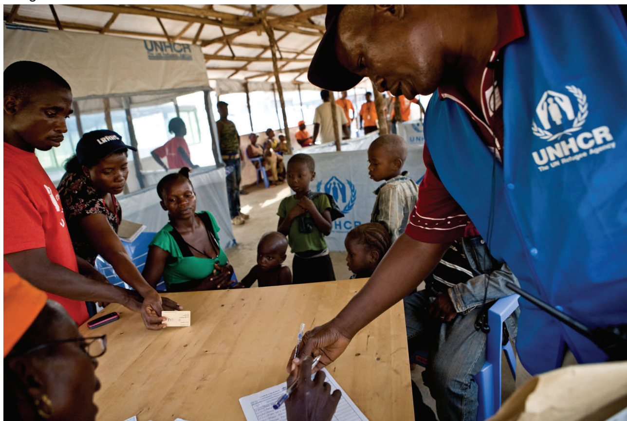
LIBERIA / FEB. 2011

On 8 th March, the Central Emergency Response Fund (CERF) allocated US$6 million to help tens of thousands of refugees who have fled to Liberia from Côte d'Ivoire. UNHCR will use $2.3 million to strengthen protection monitoring at the Liberian border, construct shelters in refugee camps, and carry out distribution of NFIs. Other agencies receiving CERF funding include: UNICEF for nutrition, water, sanitation, health response, education and protection of children; WFP for improving regional logistics and telecommunications; FAO for emergency food and security assistance to refugees and host families in Nimba County; and WHO and UNFPA for various programs to help refugees and host communities.