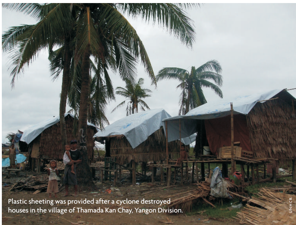
Plastic sheeting was provided after a cyclone destroyed houses in the village of Thamada Kan Chay, Yangon Division.

Transport and logistics: To facilitate monitoring and assistance activities, UNHCR maintained its