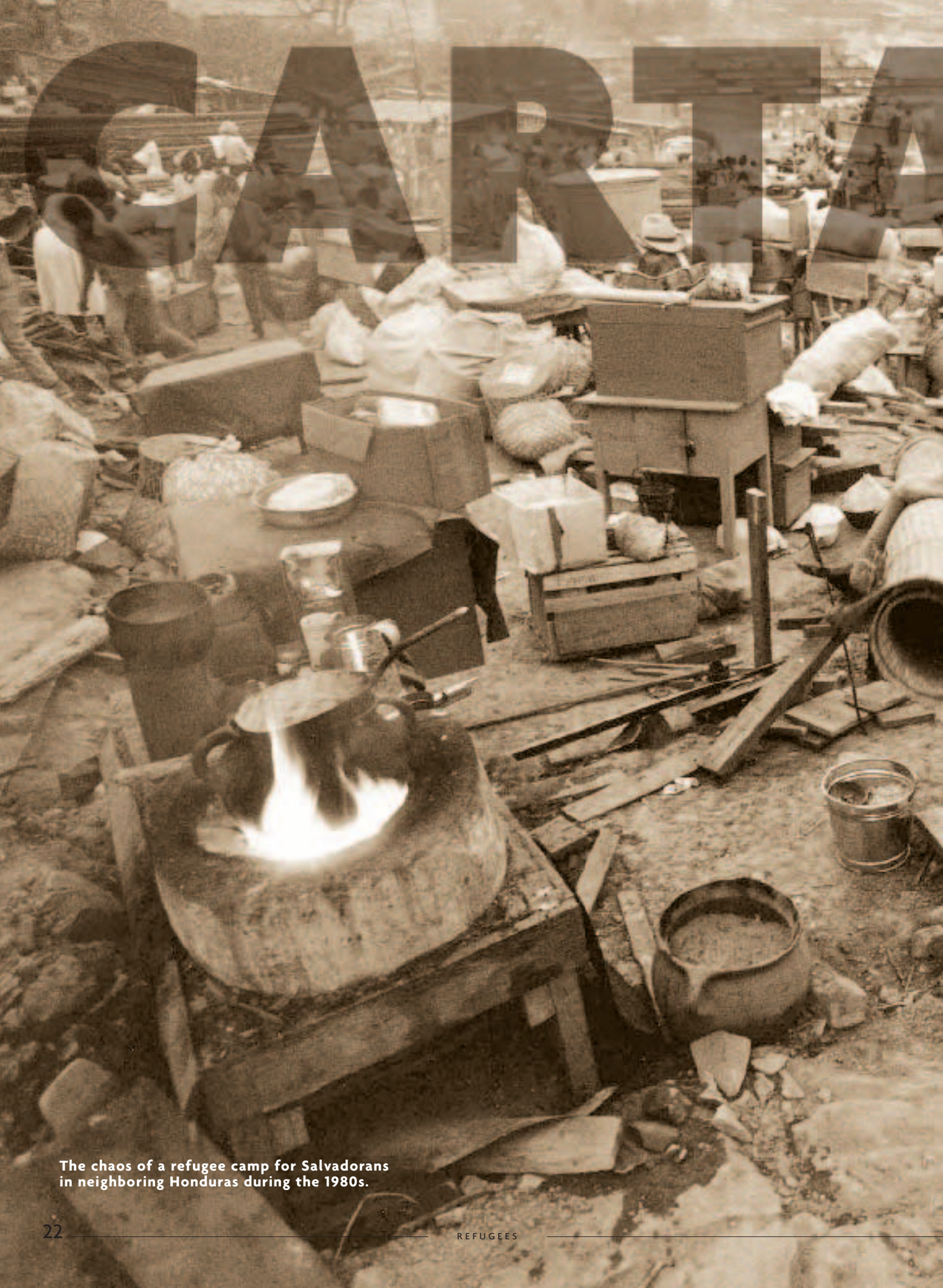
The chaos of a refugee camp for Salvadorans in neighboring Honduras during the 1980s.