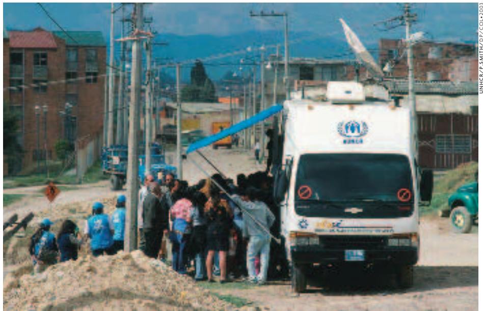
UNHCR/P. SMITH/DP/COI • 2003

There was diplomatic resistance to the Cartagena Declaration even as it began to take shape. Washington was cautious, to say the least, to parts of the document, fearing that possibly hundreds of thousands of fleeing civilians might seek asylum there based on the Declaration’s broadened definition of a refugee and that it