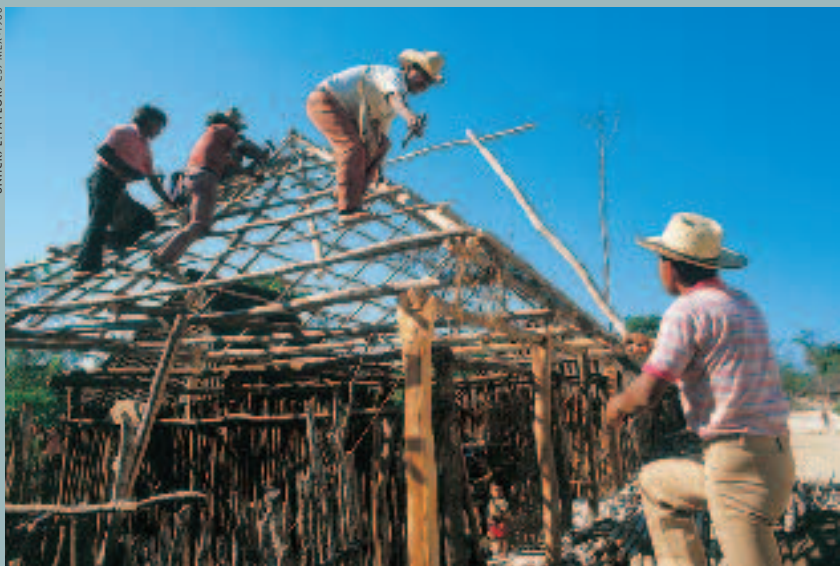
Guatemalan refugees make a new home in Mexico.

Colombia, at least two million were displaced within the country and several hundred thousands moved to neighboring states.