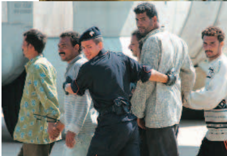
Under arrest in Lampedusa, Italy.