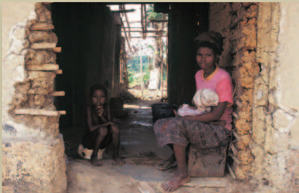
Liberia: Returning home to an uncertain future.

Nevertheless, the fragility of the situation in central Africa is highlighted when thugs armed with automatic weapons, machetes and grenades slaughter 156 Congolese, mostly women and children, at Gatumba camp in Burundi. It is