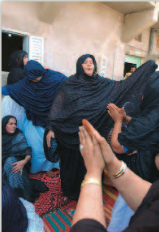
Relatives and friends meet for the first time in years in the almost forgotten emergency in Western Sahara.

Lubbers pointed out that if the efficiency of individual asylum systems was improved, a longtime UNHCR proposal, and more sound decisions were reached during initial assessments rather than hav-