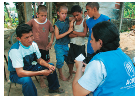
Helping new arrivals in Venezuela.