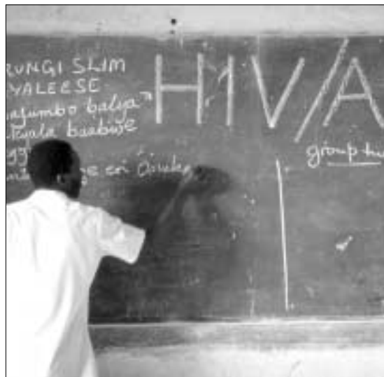
HIV/AIDS education is considered a basic right