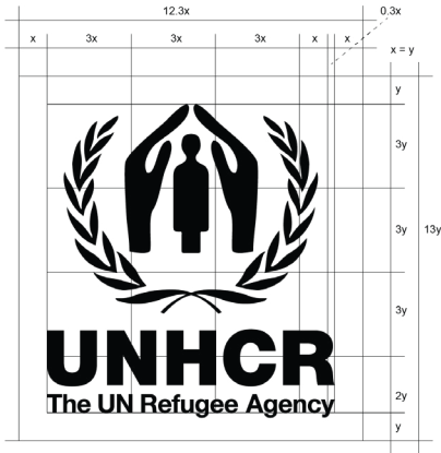
UNHCR Vertical Visibility logo