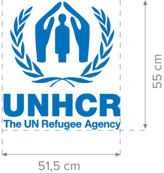
Size of the UNHCR Visibility logo on the tarpaulin