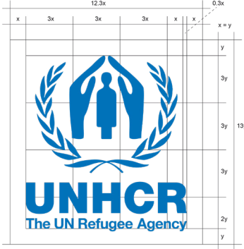
UNHCR Vertical Visibility logo