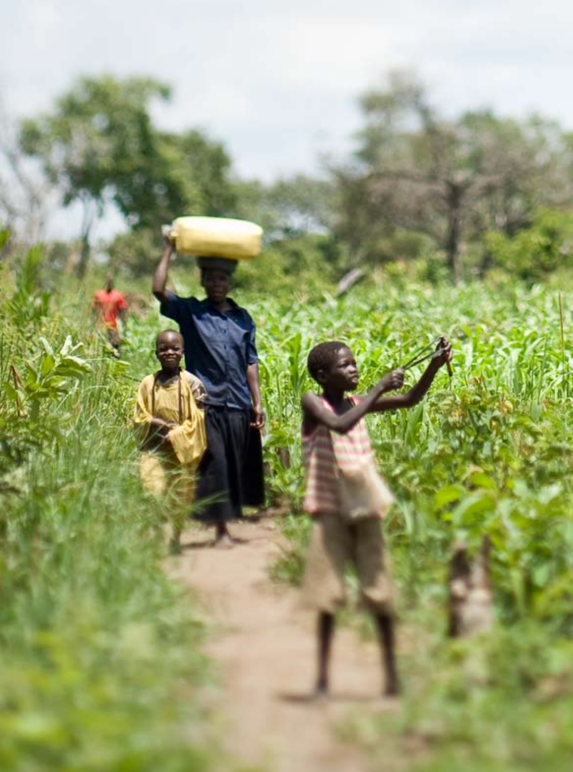
A boy in his village in Gulu district aims for a bird as his family walks along the path connecting the homesteads of his family and friends.