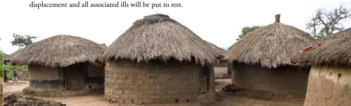
Paicho Camp, Gulu district.

Since the physical return of formerly displaced populations does not in itself equate an end to displacement, recovery and re-integration efforts continue in an effort to eradicate challenges associated with displacement and thereby bridge the gap between northern Uganda and the rest of the country. Commitment from the Government of Uganda via the framework of the Peace Recovery and Development Plan for Northern Uganda (PRDP), to stabilize and rebuild Northern Uganda with a 2008 - 2010 timeline it is hoped that displacement and all associated ills will be put to rest.