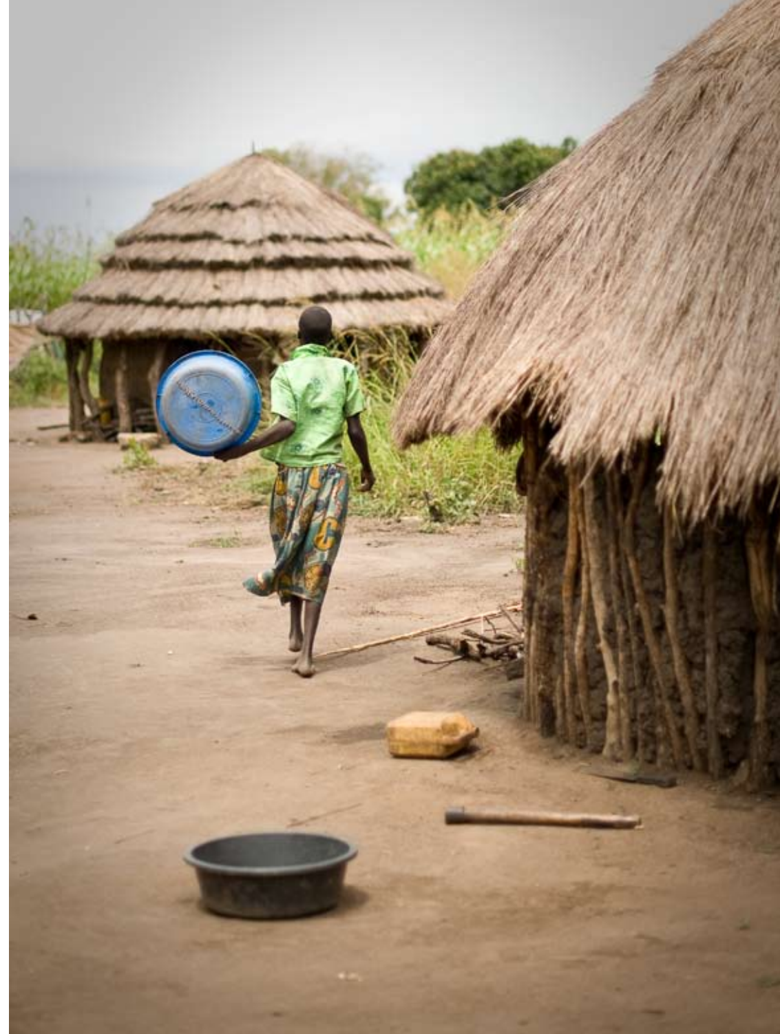
In villages such as this one in Kitgum district, daily activities like washing can be done without the struggle of crowds.

AVSI and UNHCR have been closely working with the Local Authorities, the IDPs in the camps and the returning communities to facilitate the achievement of these solutions. The progress of the return offers a measure of evaluation of the impact of these actions, however many individuals, especially the most vulnerable, still strive to put an end to their displacement. Moreover, the situation in the return areas and the lack of services, does not favor the presence of people with specific needs.