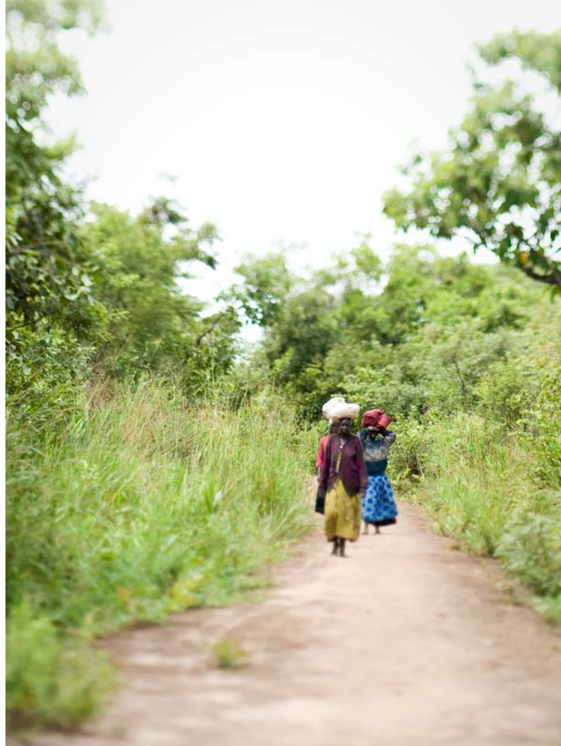
Women make their way home from washing clothes at a stream outside of Acet camp, Gulu district.

It is not possible to recreate the society present prior to the war; and this should not be the aim of development workers. The new society that will emerge will maintain its roots of the prewar years but will have the strength and willingness of a society that is struggling to restart from zero.