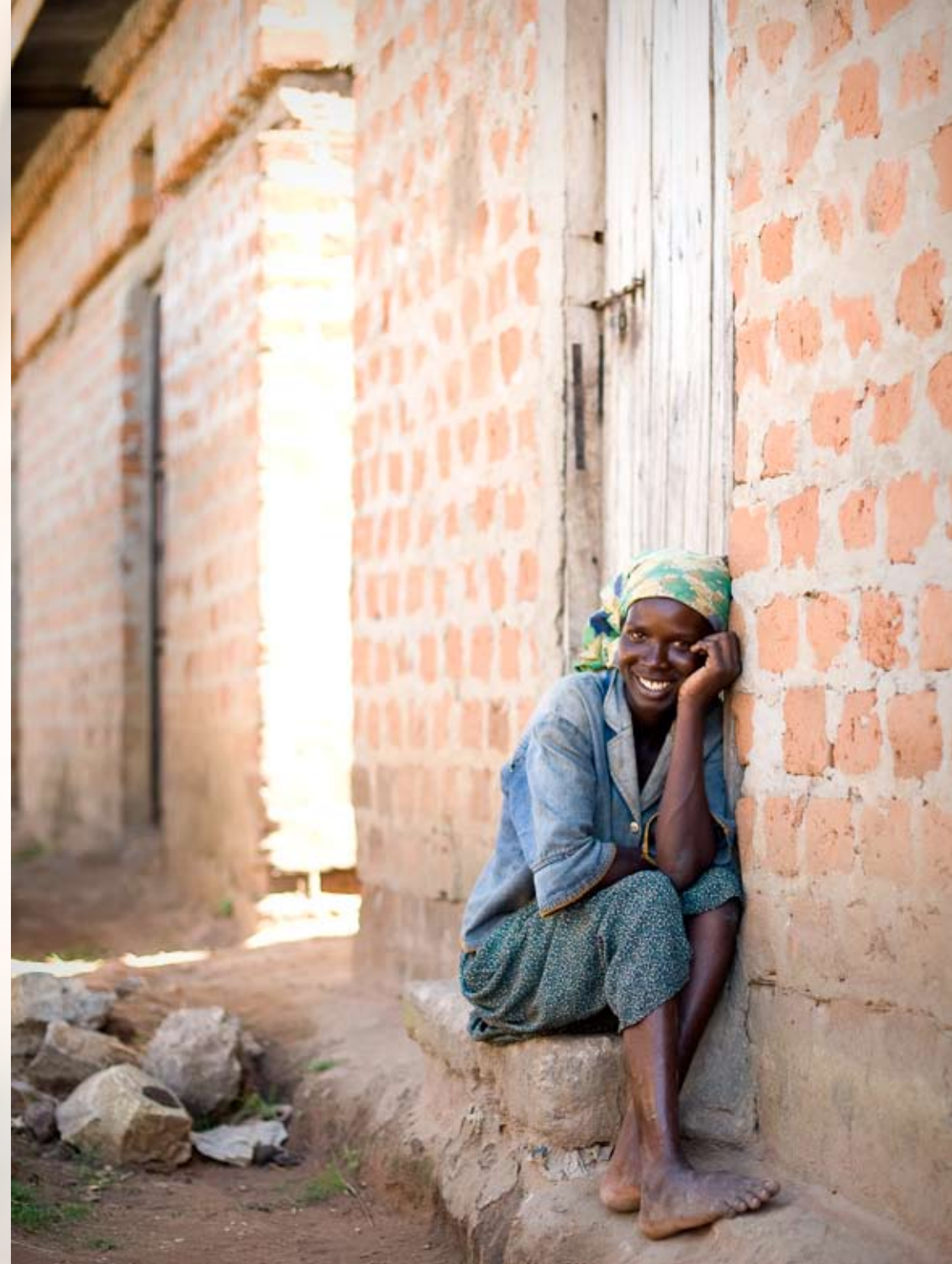
The daughter of a landowner in Opit Camp, Gulu district. For those whose ancestral home is in the towns and trading centers that became camps, there is little to do but wait for a return to “normalcy.”

As the global leader in protection, The UN Refugee Agency (UNHCR) intervened in northern Uganda in the summer of 2006 amid the inception of peace talks in Juba (South Sudan) between the LRA and the Government of Uganda, and a signing of a Cessation of Hostilities agreement between the LRA and the Government of Uganda. Partnering with UNHCR, AVSI has been involved in Camp Management (CCCM) and Return and Protection Monitoring activities in the districts of Gulu, Kitgum and Pader.