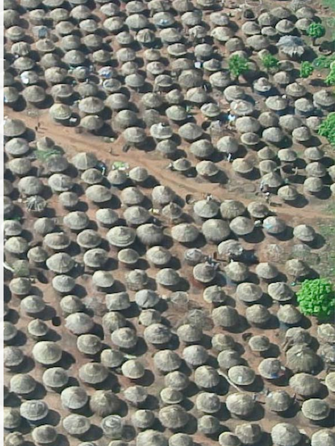
IDP camps, such as this one in Kitgum district in 2004, offered little space for the typically free-roaming displaced population in Acholiland.

On April 10, 2008 Joseph Kony failed to appear for a signing of the Final Peace Agreement (FPA) between the LRA and the Government of Uganda at the Juba Peace Talks. The military operation "Lightning and Thunder" was launched in December '08 by the Government of Uganda, Southern Sudan and Democratic Republic of Congo (DRC) against the LRA position in Garamba National Park in DRC. The operation weakened the LRA, but failed to capture Kony and dismantle completely the LRA. Although LRA has not carried out any actions in Uganda since the operation in DRC, the LRA is still present and active in DRC, South Sudan and Central African Republic (CAR) having abducted or killed thousands civilians since the onset of Operation Lightning Thunder.