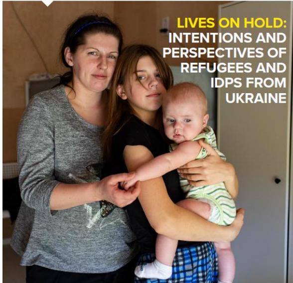
REGIONAL INTENTIONS REPORT #4 JULY 2023

UNHCR continues to consult Ukrainian refugees and internally displaced people on their intentions and concerns and published an updated report presenting findings regarding the intentions of both refugees and IDPs, to provide a comparative view of intentions and the different underlying factors influencing decision-making.