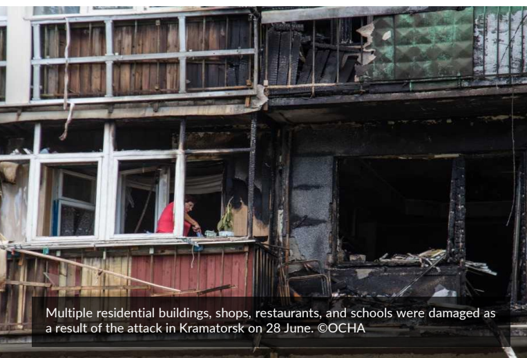
Multiple residential buildings, shops, restaurants, and schools were damaged as a result of the attack in Kramatorsk on 28 June.