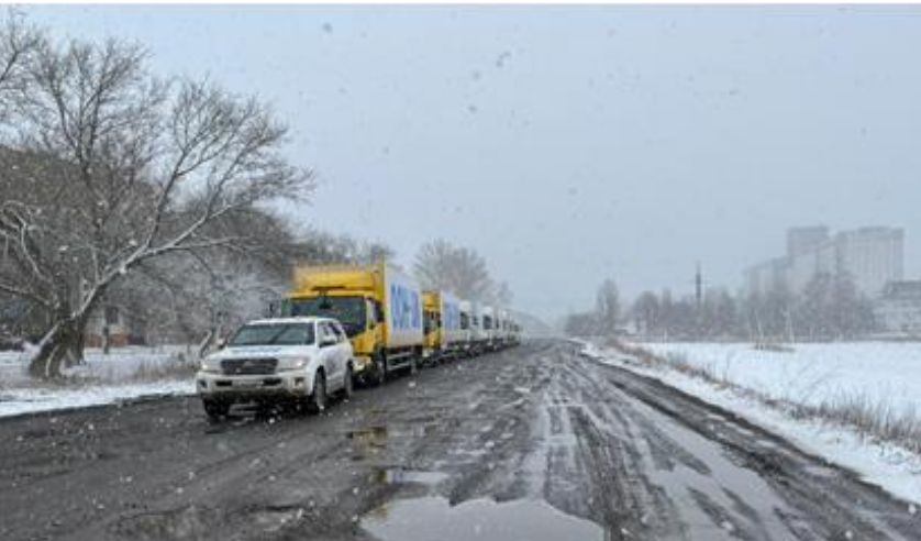
As part of the interagency convoy to Kharkivska oblast on 31 March, UNHCR delivered emergency shelter materials, solar lamps, and hygiene items.

Since the start of the full-scale invasion in February 2022, UNHCR has delivered life-saving assistance through a total of 835 humanitarian convoys, including contributions to 60 interagency convoys to date.