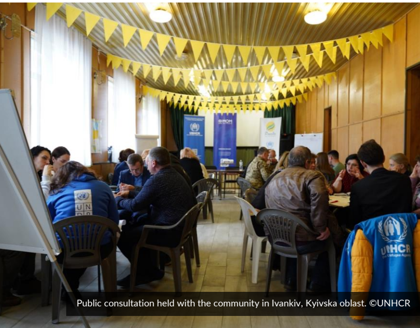
Public consultation held with the community in Ivankiv, Kyivska oblast.