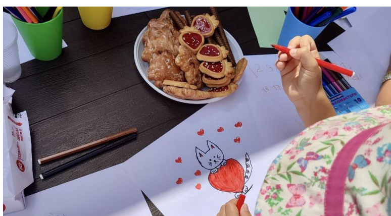
UNHCR's NGO partner, The Tenth of April, organized a family art festival in Tzebrivko village which hosts 150 internally displaced people, June 2022.

Given the immense needs and the expanded scale and scope of the humanitarian response, UNHCR is urgently seeking $536.8 million to deliver assistance inside Ukraine in the revised Supplementary Appeal . (Excludes funding requirements for UNHCR's asylum and statelessness programmes.)