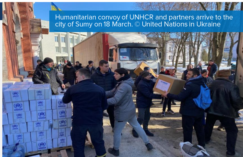
Humanitarian convoy of UNHCR and partners arrive to the city of Sumy on 18 March.