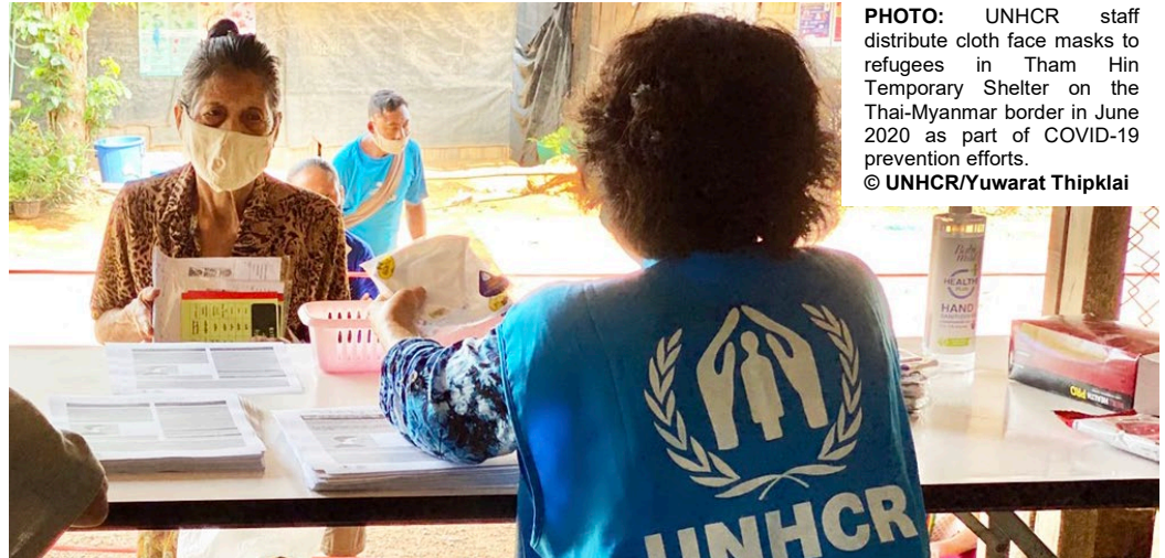
PHOTO: UNHCR staff distribute cloth face masks to refugees in Tham Hin Temporary Shelter on the Thai-Myanmar border in June 2020 as part of COVID-19 prevention efforts.

1 Country Office in Bangkok 2 Field Offices in Mae Hong Son and Mae Sot