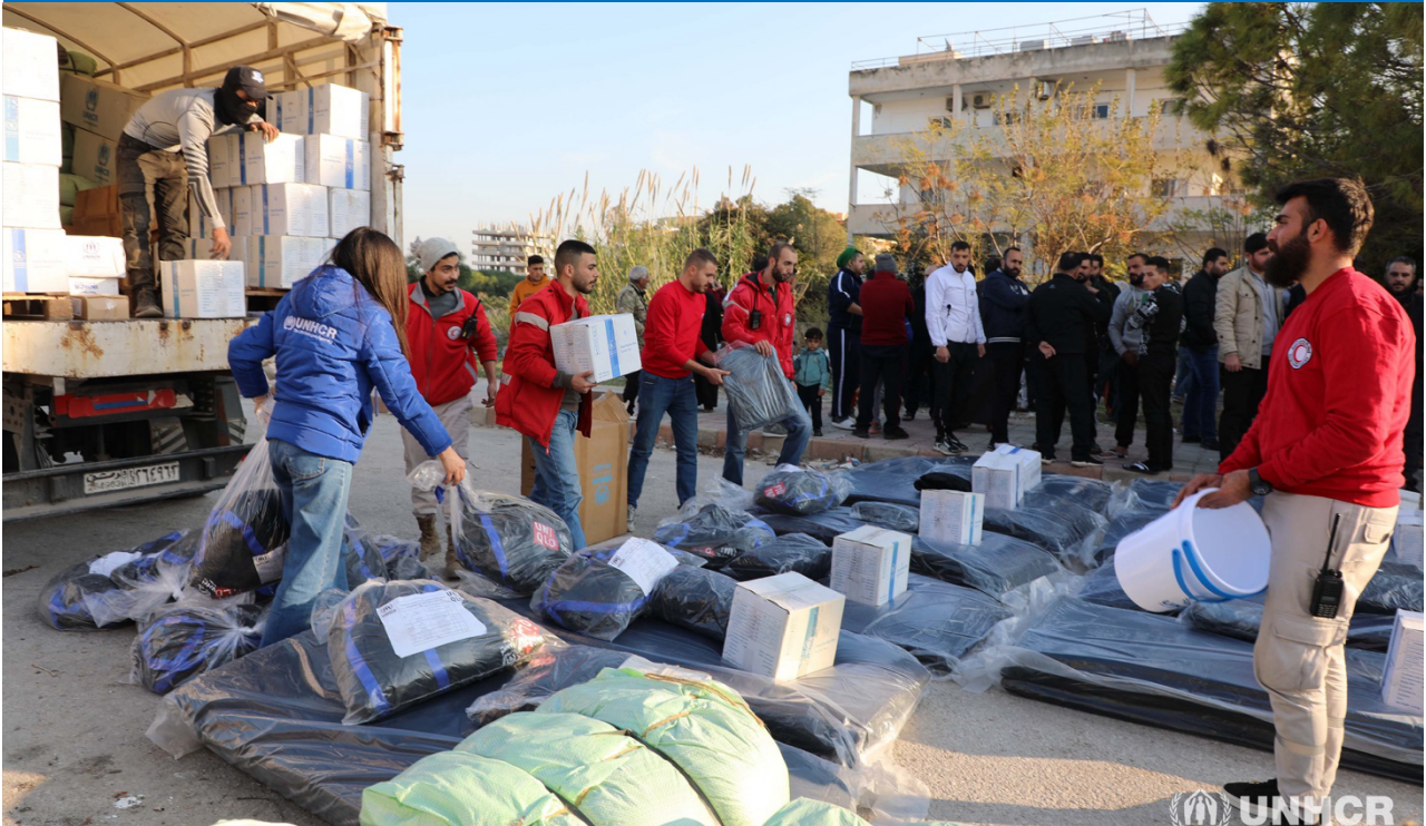
Distribution of core relief items in Tartous for internally displaced persons from Aleppo

Following the clashes that erupted in Aleppo on 27 November, consequently leading to a fundamental shift in the situation in Syria, UNHCR maintained its presence and continued its response across the country to support affected populations. 1