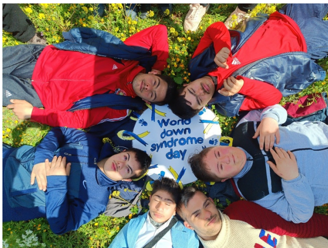
UNHCR and partners organized activities in Souran (Hama Governorate) for 120 children and their caregivers on the occasion of the World Down Syndrome Day on 21 March. This included awareness-raising and recreational activities carried out by home-based rehabilitation specialists, a health point doctor, and a psychologist to improve social integration of children with Down Syndrome and reduce stigma and stereotypes.