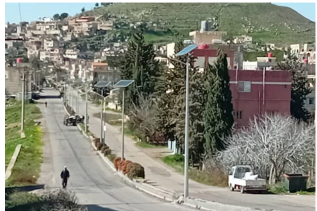
Installation of solar streetlights in under-served areas in As-Sweida Governorate.