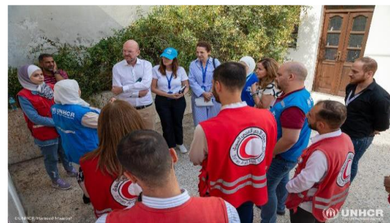
Protection Mission to SO Aleppo meeting SARC legal team.

Between 2 and 5 October, a protection mission to Aleppo led by the Assistant Representative for Protection was conducted. The mission members met with the Head of Civil Affairs, the Director of the Provincial Cadastral Department, the Head of the Immigration Department, and the Head of Department of Social Affairs and Labor. The mission visited the Civil Registries rehabilitated by UNHCR in Khal Al Hariri, Sabaa Bahrat, Aleppo,