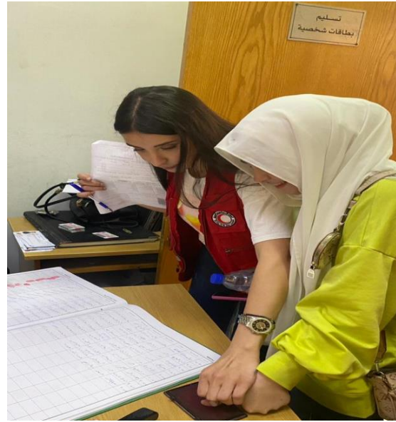
Legal support for issuing civil documentation/IDs for the students coming from neighbouring countries to sit for national exams.

During National Exams, UNHCR provided legal support through partners for the 9th and 12th grade students, who are from Lebanon and non-government-controlled areas. They were supported in obtaining IDs and facilitating their participation to sit the national exams. In coordination with the Ministry of Education, and the Directorate of Civil Affairs, 4,942 students were assisted to apply for and obtain their IDs.