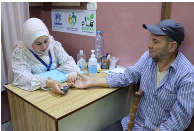
Health counselling at As-Sukkary health point, Aleppo Governorate.