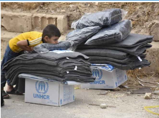
Distribution of winter items to IDPs in Morek, Hama Governorate. The items include extra high thermal blankets, sleeping bags, waterproof floor covers, extra plastic sheeting, portable heaters, rubber boots, and winter jackets.