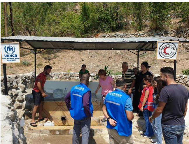
UNHCR and its partner's staff in a monitoring visit to a completed community-led initiative in Ras Al-Basit, rural Latakia Governorate. The initiative aimed to rehabilitate a spring to support more than 200 families (around 1,000 individuals) in having access to potable water.