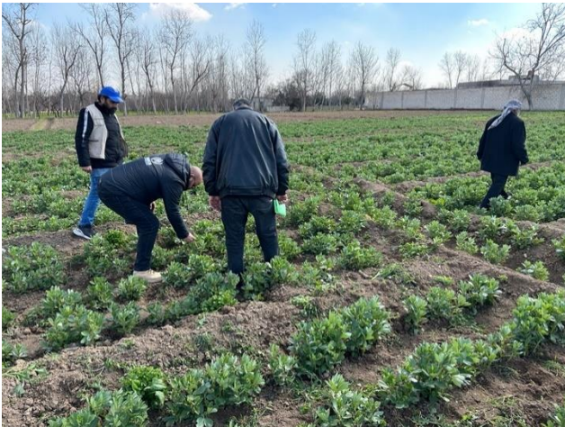
Agricultural project supported by UNHCR in Eastern Ghouta, Rural Damascus Governorate.