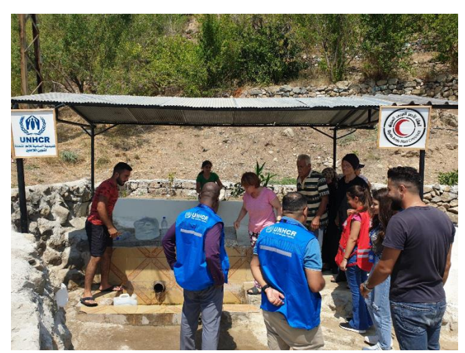
UNHCR and its partner's staff in a monitoring visit to a completed community-led initiative in Ras Al-Basit, rural Latakia Governorate. The initiative aimed to rehabilitate a spring to support more than 200 families (around 1,000 individuals) in having access to potable water.