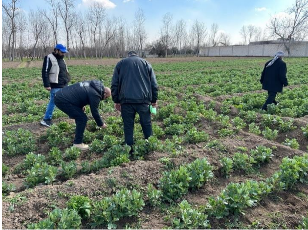
Agricultural project supported by UNHCR in Eastern Ghouta, Rural Damascus Governorate.