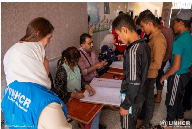
Provision of legal support to students travelling to take their national exams in June. This legal assistance included support to access documentation such as ID cards, which are required for students to take their exams.