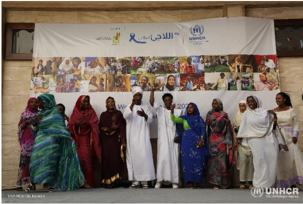
A talent show was held at a UNHCR-supported community centre in Damascus on 20 June, World Refugee Day. See more stories and photos from World Refugee Day in Syria here .

dish. Meanwhile in Qamishli, young people united over sports and over 400 refugees and Syrians participated in athletic races and games.