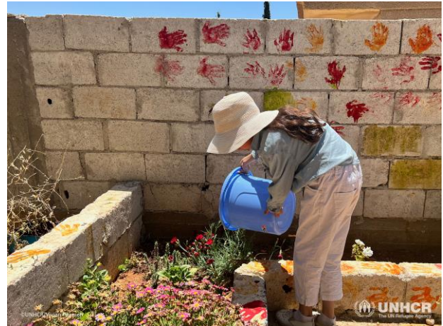
A UNHCR-supported community centre in Damascus organized environmental awareness activities on 5 June to mark International Environment Day.