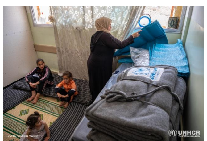
UNHCR and partners supported the rehabilitation of mid-term collective shelters for people affected by the earthquakes in Aleppo Governorate.