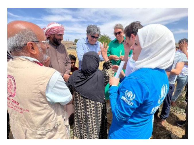
In May, the UNHCR Representative and the Ambassador of Switzerland visited UNHCR projects in Deir-ez-Zor Governorate, north-east Syria, including farmers who had received agricultural inputs.