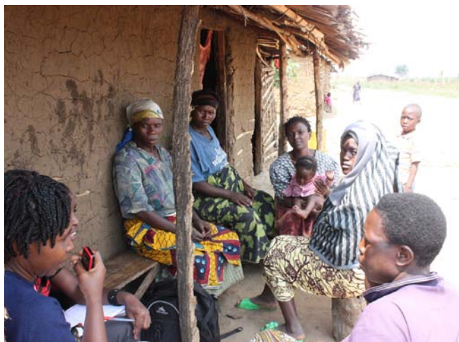
Women in the community gathered for a group discussion.

We visited Uganda to examine the extent to which refu-