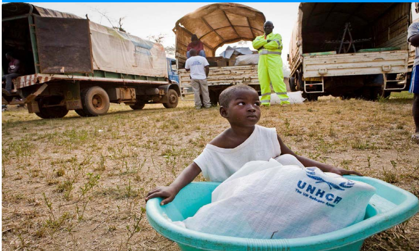
Liberia / refugees from Ivory Coast / A small girl waits to be loaded into a UNHCR truck to be taken from the Liberia-Ivory Coast border to the Bahn Refugee camp. UNHCR G. Gordon/February 2011

The upsurge of violence in Côte d'Ivoire , in particular in the west, sent new waves of refugees into Liberia. Violent clashes in Abidjan's northern suburb of Abobo and the neighbouring district of Anyama displaced up to an estimated 350,000 people internally. As the political deadlock continues the security situation is sharply deteriorating in many parts of the country, as is the humanitarian situation. Côte d'Ivoire also hosts some 24,000 Liberian refugees, many of whom feel at risk. On 19 March, UNHCR will start the airlift of Liberian refugees back to their country. Thus far, some 300 have signed up for this programme.