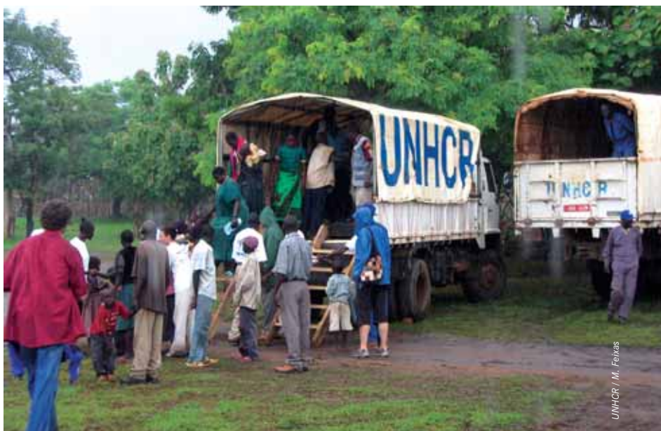
Sudanese women and children arriving in their homeland after decades of exile in Uganda.