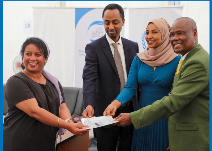
Thanks to PING, UNHCR and government officials in Ethiopia were able to hand out digital ID cards to refugees and asylum-seekers.

The Gateway facilitates exchanging any personal data or information with UNHCR. This includes biographic data and information recorded in UNHCR's PRIMES registration database as well as biometrics data of individuals.