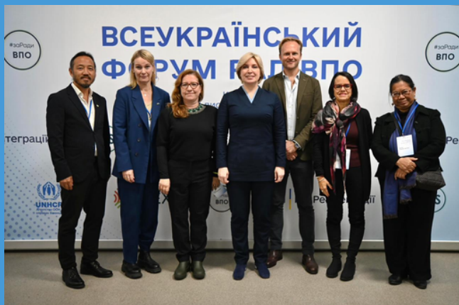
IPEG delegation with Vice Prime Minister Vereshchuk, Ukraine, Nov 2023.

Enhancing protection in situations of internal displacement through coordinated, collaborative, and targeted support