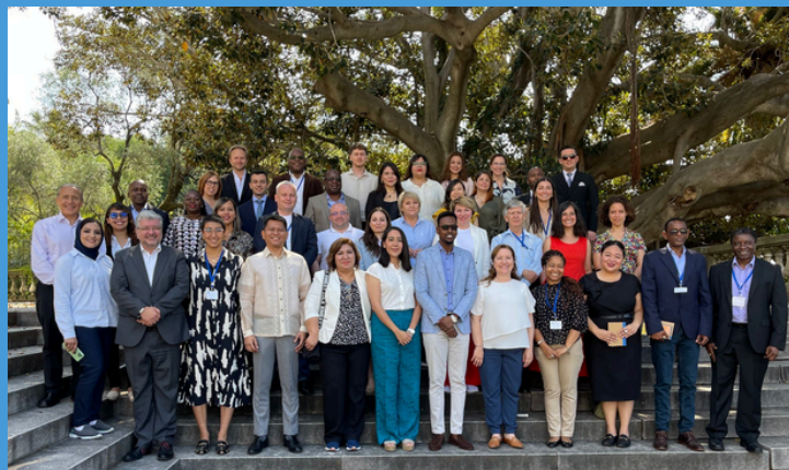
Cross-Regional Forum on IDP Laws and Policies, Sanremo, June 2023.