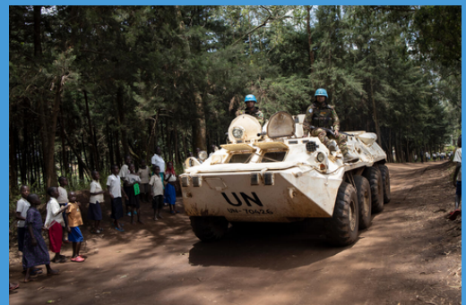
MONUSCO patrol near Bunia, Ituri, 2022.

The IDP Protection Expert Group – IPEG – is co-led by the Special Rapporteur on the Human Rights of Internally Displaced Persons, UNHCR and the Global Protection Cluster. See more here