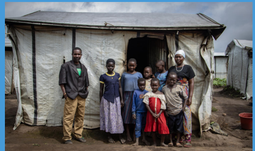
Mbala displacement site in Urumu, Ituri, 2023.