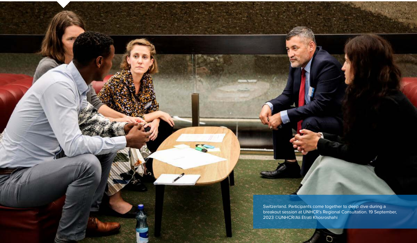
Switzerland. Participants come together to deep dive during a breakout session at UNHCR's Regional Consultation. 19 September, 2023