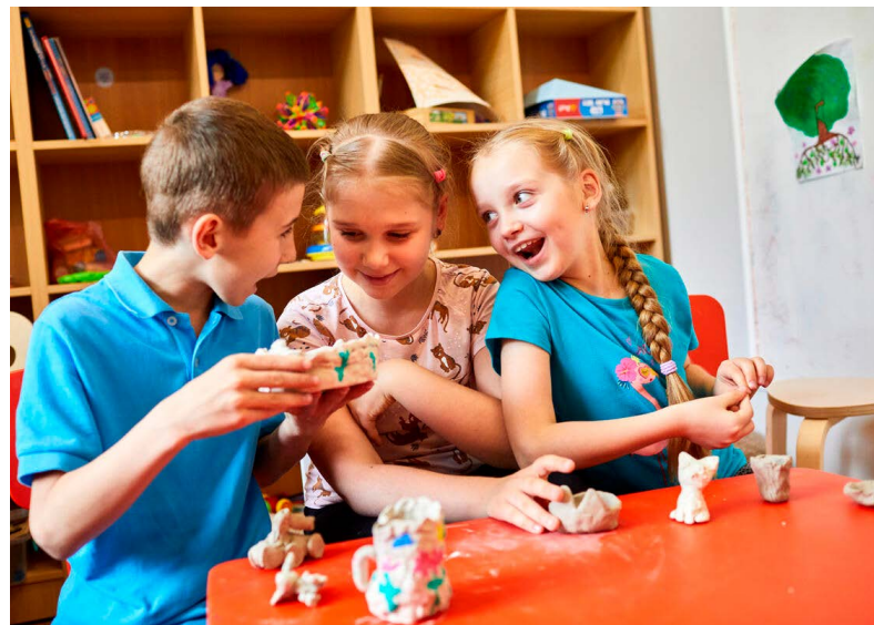
Romania. Art therapy for Ukrainian refugee children