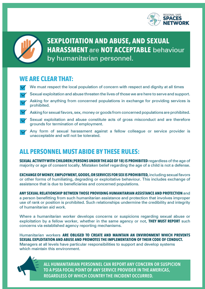
Poster for personnel and service providers