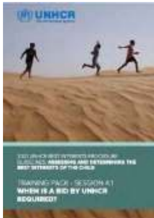
Click the image