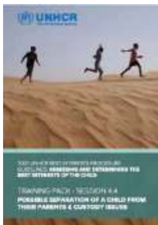
Click the image