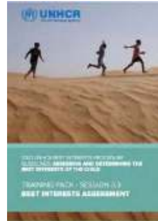
Click the image