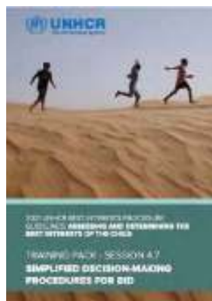
Click the image