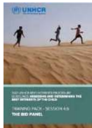
Click the image