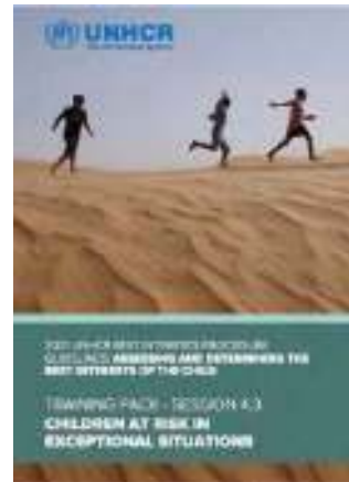
Click the image