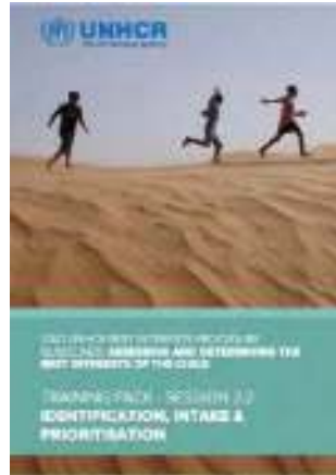
Click the image