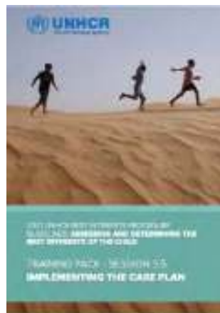
Click the image