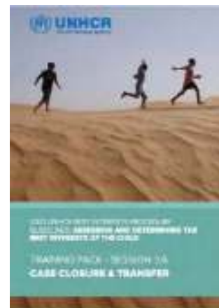
Click the image