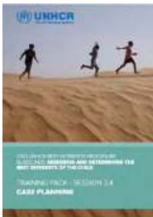
Click the image