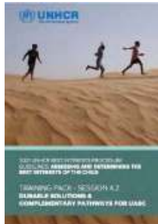
Click the image