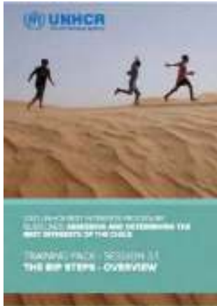
Click the image