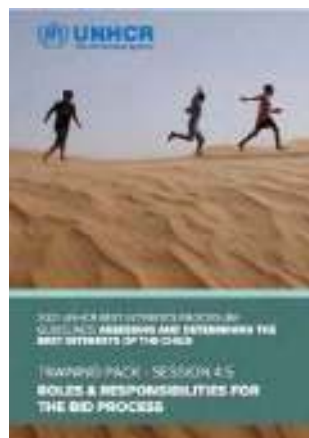
Click the image