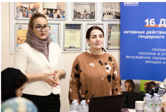
Psychosocial Support (PSS) workshop in Moscow backed by UNHCR

* funding allocated from unearmarked contributions