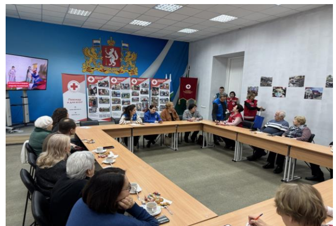
UNHCR meeting with Ukrainian refugees living outside of Temporary Accommodation Points at the local branch of the Russian Red Cross in Yekaterinburg