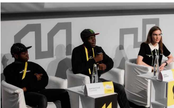
Q&A session at the International LAMPA Festival in Perm with a refugee family living in Russia and sharing their integration experience

* funding allocated from unearmarked contributions