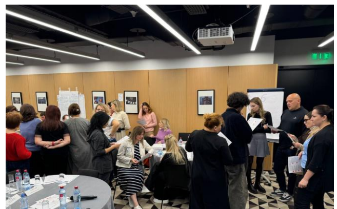
Capacity building workshops for UNHCR partners in Moscow