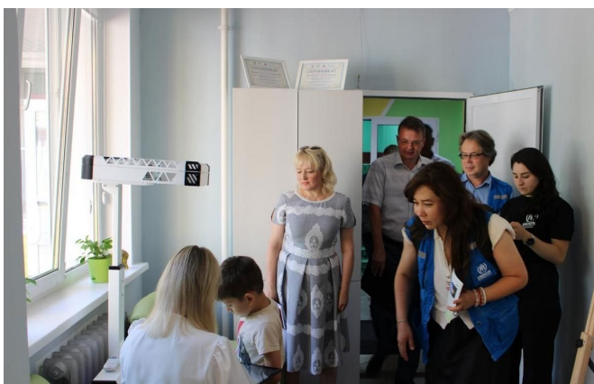
UNHCR representatives visiting a medical point at a Temporary Accommodation Point in Mordovia