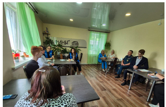
UNHCR meeting with refugees from Ukraine in Komi