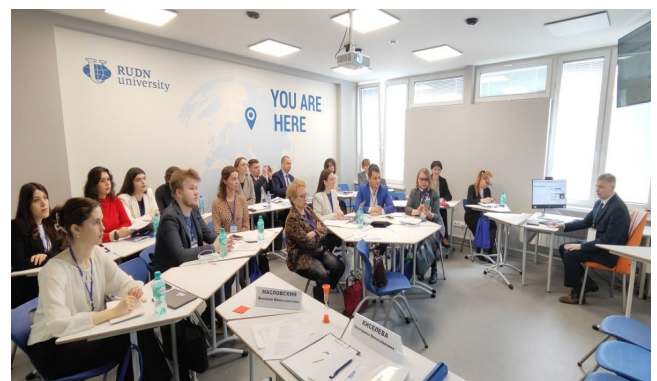
UNHCR at an information session on international legal regulation of forced displacement at RUDN University in Moscow