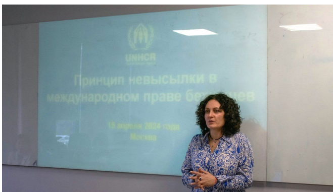
UNHCR making a presentation on the principle of non-refoulement for students of MGIMO Model of United Nations