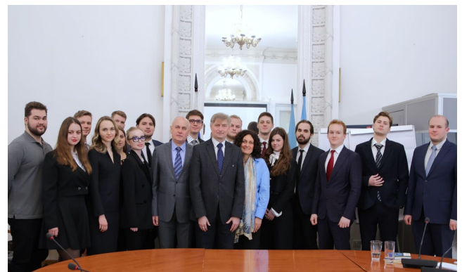
UNHCR representatives at an awareness-raising session on refugee protection for the students of the Diplomatic Academy