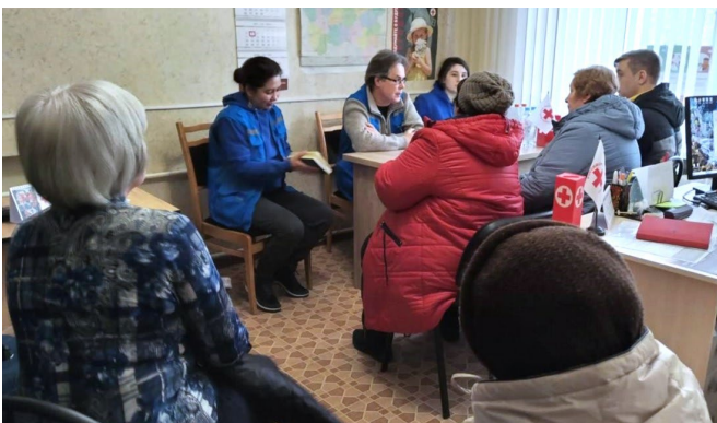
UNHCR meeting with Ukrainian refugees in Bryansk region