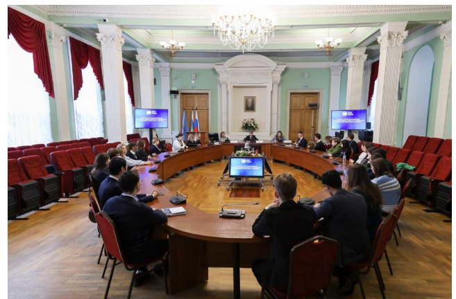
UNHCR delivering a lecture for students-participants of Model United Nations at the Diplomatic Academy of the Russian MFA