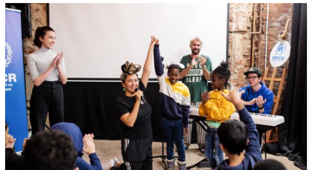
GWA Manizha during a music lesson for children at an inclusive center in Moscow