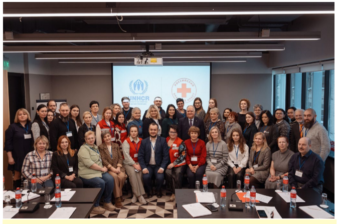
Participants of UNHCR's seminar for Russian Red Cross