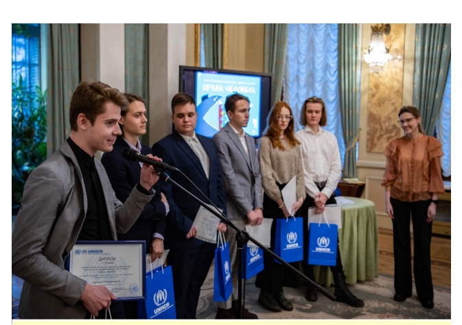
Ceremony of awarding diplomas to student participants of a human rights contest