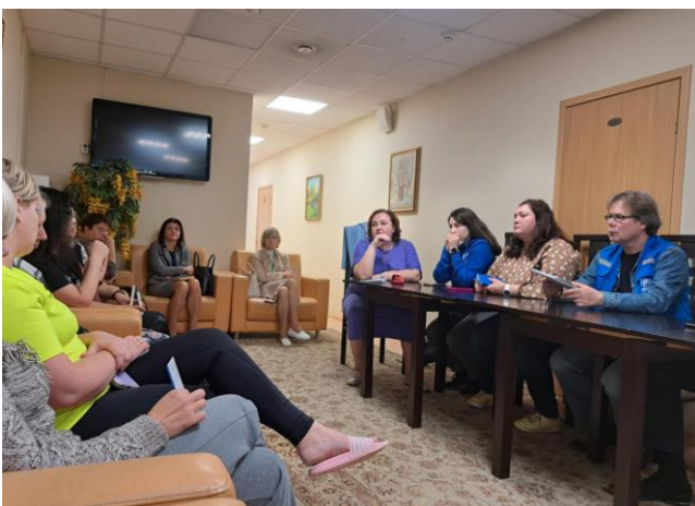
UNHCR visiting a Temporary Accommodation Point in Ryazan