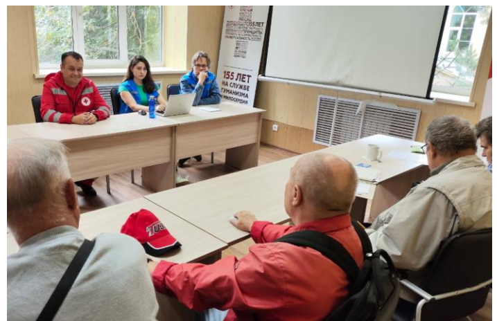
UNHCR and the Russian Red Cross meeting with Ukrainian refugees living outside of TAPs in Vologda