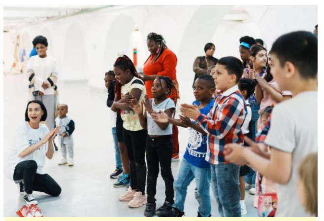
Event at the "Point of Displacement" festival for World Refugee Day, dedicated to refugee children