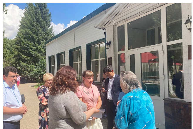
UNHCR Russia staff held a meeting with refugees from Ukraine in Ufa