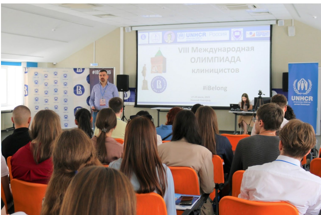
VIII International Olympics of Legal Clinicians discussing statelessness in Nizhny Novgorod