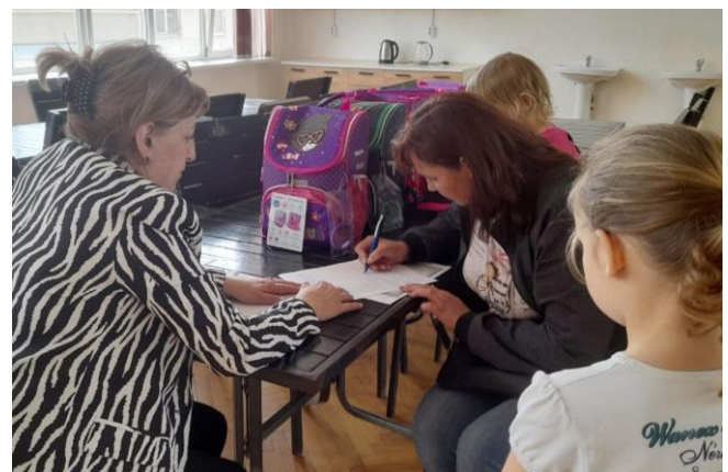
UNHCR Russia NGO partner "Faith, Hope, Love" provides humanitarian aid to refugee children from Ukraine living in a TAP in Pyatigorsk